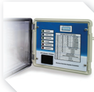
C-23 electronic controller

Available in a variety of sizes to maneuver into the smallest of doorways, these rotational molded polyethylene tanks are built to last. Tanks include a self-venting lid and are pre-plumbed with liquid level float controls for reliable starting and stopping of the RO system.